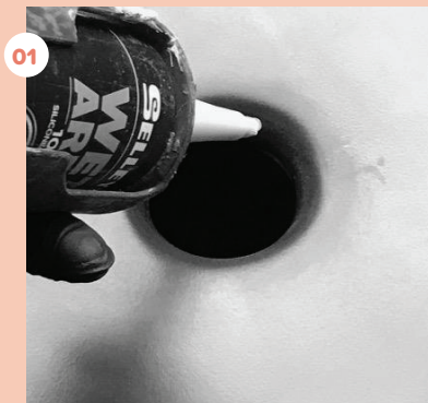
01 Run a bead of clear wet area silicone around the waste rim