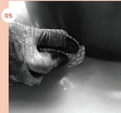
05 Smooth silicone off to a neat finish and wipe clean with wax and grease remover