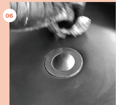
06 Clean excess with wax and grease remover and let dry for 24 hours