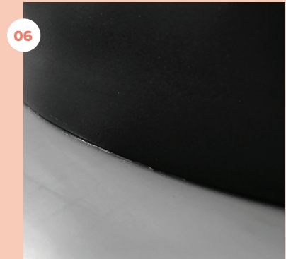
06 Please ensure the edge is waterproof and 100%, so that water can never get under the basin