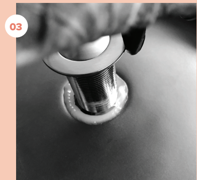
03 Slide waste into place