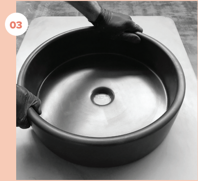
03 Press down into benchtop and remove excess silicone using wax and grease remover and soft cloth