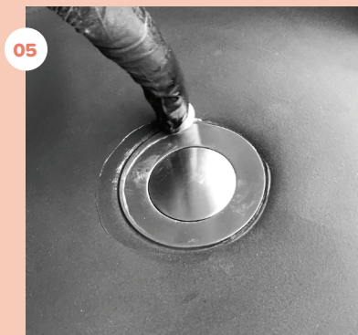
05 Carefully push silicone around gap between waste and sink