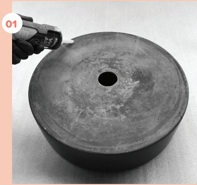
01 Run a line of clear wet area silicone around the underside of the basin 10mm back from the edge