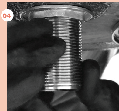
04 Hand-tighten waste. Do not over tighten.