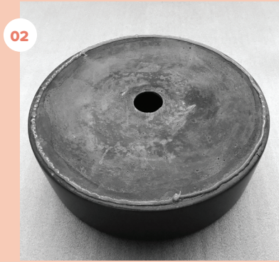
02 Run another line of clear wet area silicone 20mm back from the waste hole