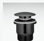
ACPUW-CU Pop-up Waste