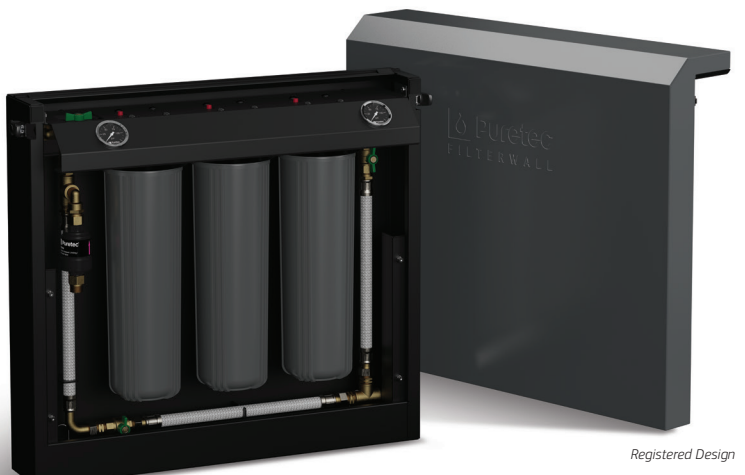
3-Stage Filtration System with bypass and PVM