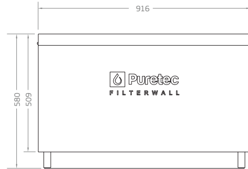
Front view w/ cover