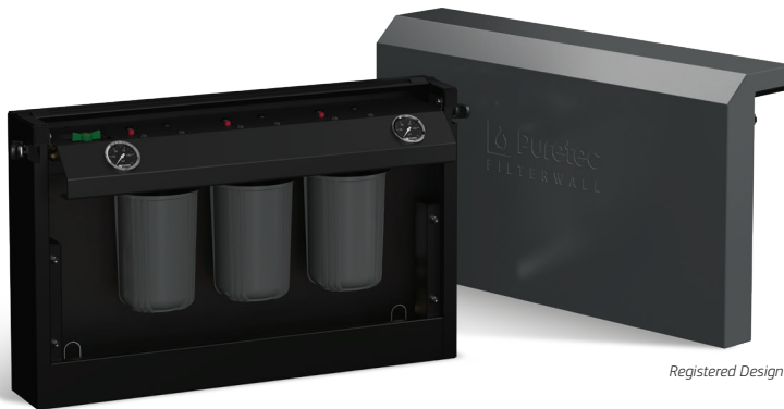
3-Stage Filtration System - no bypass