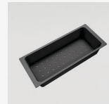
ACWSC1596BK Black Workstation Plastic Colander