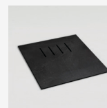
ACWSB1596BK Black Workstation Preparation Board