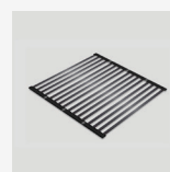
ACWSRM1596BK Black Workstation Roller Mat