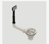
AC10 Basket Waste with Rectangular Overflow