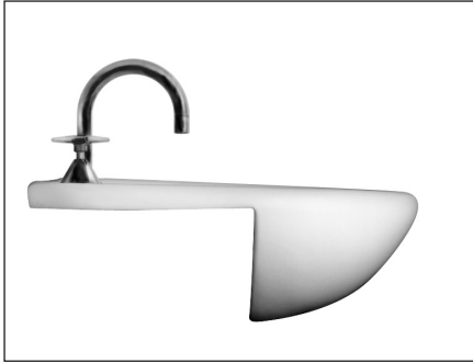
Tapware shown not included.