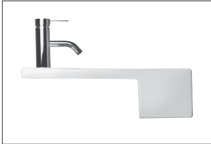
Tapware shown not included.

The Liano semi recessed basin has been designed to meet the needs of the designer market for prestige projects. An architectural minimalist style was adopted for the square Liano incorporating a generous bowl area and distinctive tapware platform. The rim is sealed to the counter top with an acetic cured silicone sealant. The basin is suitable for domestic, commercial and disabled people applications.