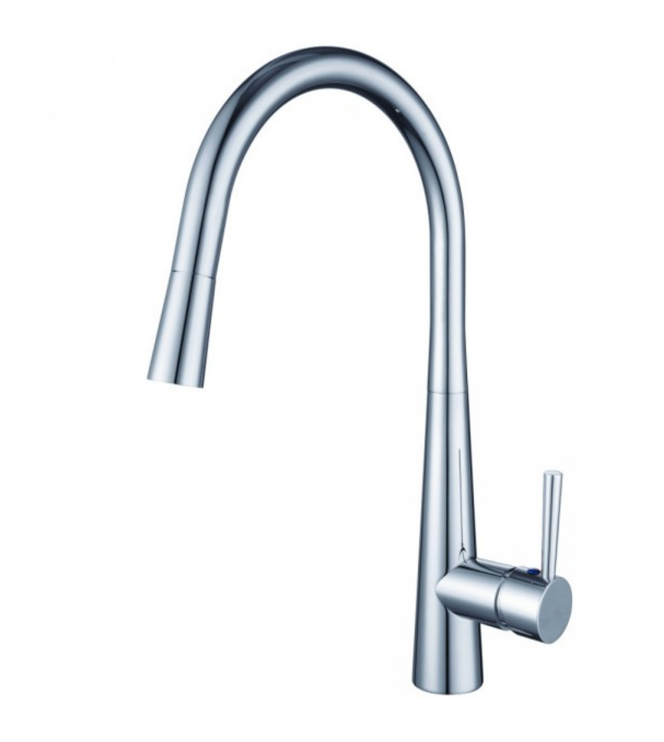
Madison Sink Mixer with Pull Out Spray